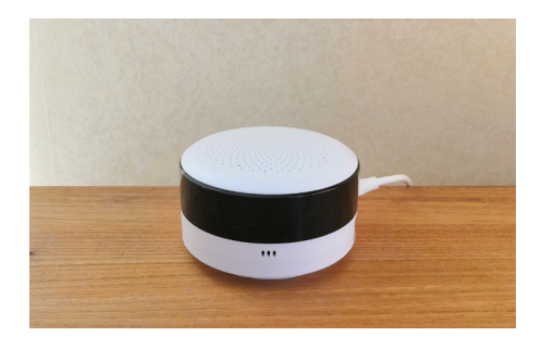
Fig. 2 The latest version, Aragon WL, is the table-top model, it uses Wi-Fi and cable connection and is powered by a USB charger.