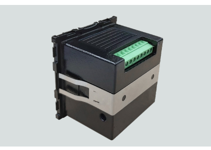
Fig.1 The Aragon PoE is flush-mounted and fits into a standard switch-box, it is powered over PoE.

Their innovative technology won awards in Germany from the prestigious Smarthome Deutschland conference for one of the best new smart-home products on the market in 2020 and 2021.